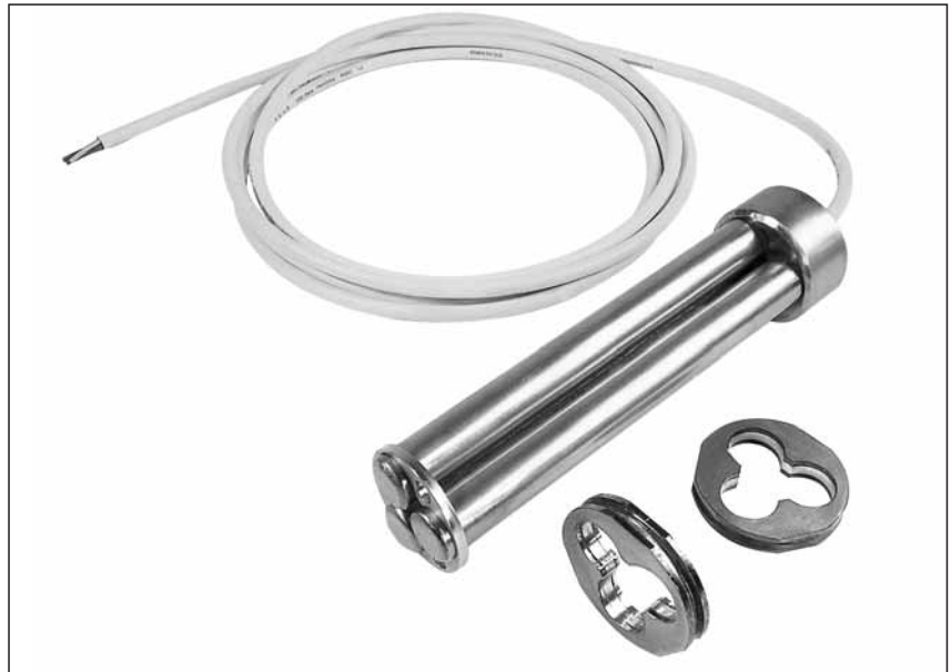
Compact electric tank heater, retrofittable magnetic clamps.

heatsystems compact electric tank heaters prevent liquid media from freezing by direct heating. They operate by immersion into the medium. The electric protection type is IP 68, 5 bar. A side connection below the medium level of the tank is unnecessary. The tank heater is inserted into the tank through an opening in the top section. This must have a diameter of 66 mm or 70 mm (for mounted magnetic clamps). A thermostat with a switch-off temperature of 40 °C is installed as standard.