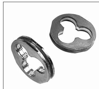
Available magnetic clamps.

The magnetic clamps also serve to "collect" iron particles in the tank.