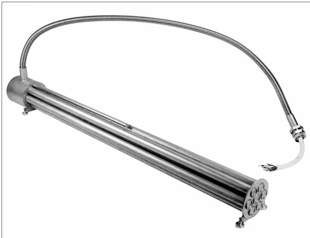
Electric tank heater with built-in temperature limiter / capacity 12 kW.

heatsystems electric tank heaters are immersed completely into the medium to be heated. A complete program