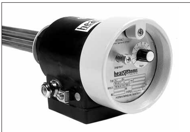
Screw-in heater with explosion-proof connection housing. Capacity 3 kW. Built-in temperature limiter, wired for direct switching. Temperature class T3.