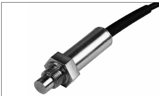
Frost protection heater with built-in thermostat, screw-in thread 1/2".