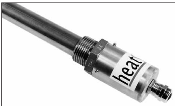
Screw-in cartridge heater. Capacity 2.2 kW, thread 1", cable screw connection axial.