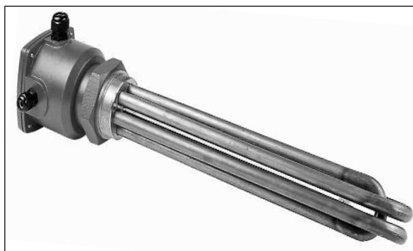
Screw-in heater for medical baths. Heater made of stainless steel Incolloy 825 (2.4858), welded into screw connection made of stainless steel AISI 316L (1.4404/1.4435).