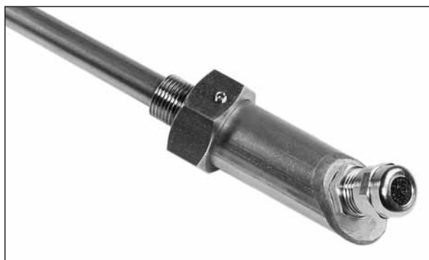
Screw-in cartridge heater, thread 3/8", connection housing made of stainless steel.