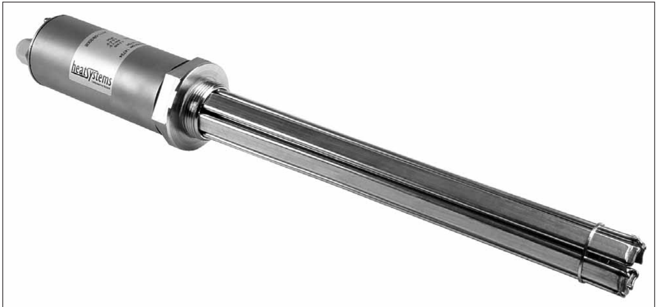
Screw-in heater with oval heating elements.

heatsystems screw-in heaters are designed for direct heating of different liquid and gaseous media.