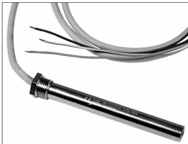
Screw-in cartridge heater. Capacity 500 Watt, thread 1/2", silicone cable 1,000 mm.