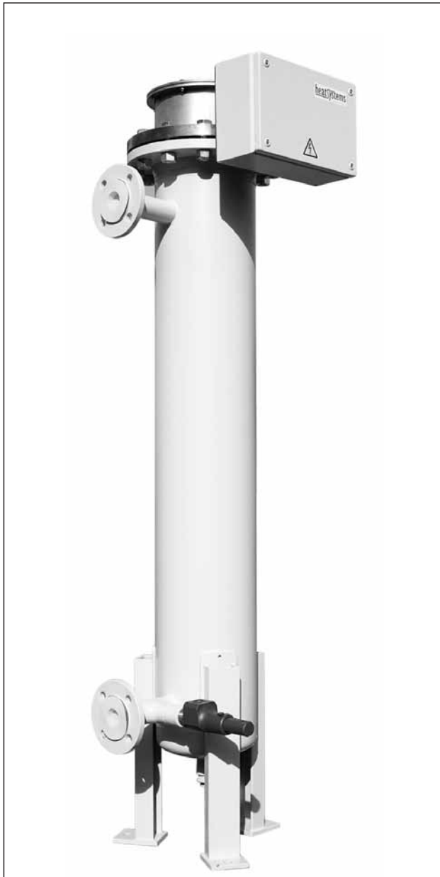
Electric heavy oil pre-heater, vertical version, with safety valve. Capacity 18 kW.