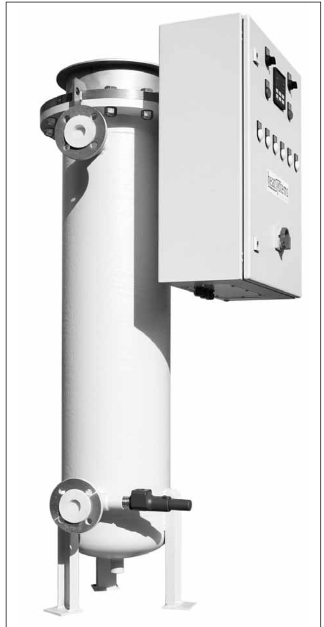
Electric heavy oil pre-heater, vertical version, with safety valve and control cabinet. Capacity 30 kW.